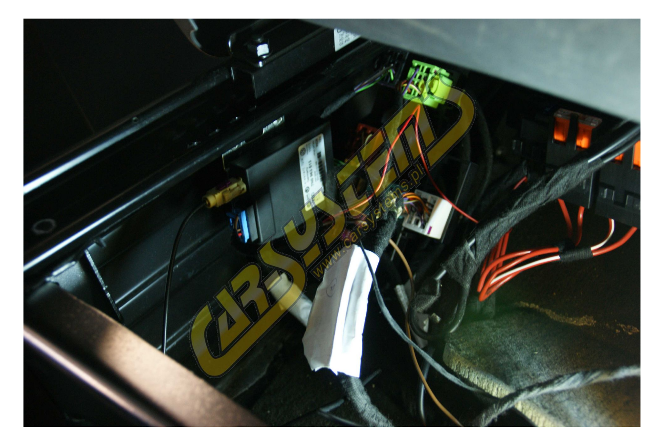
Tie the wire as original installation.

Put in telestart module, insert blue plug and antenna plug.