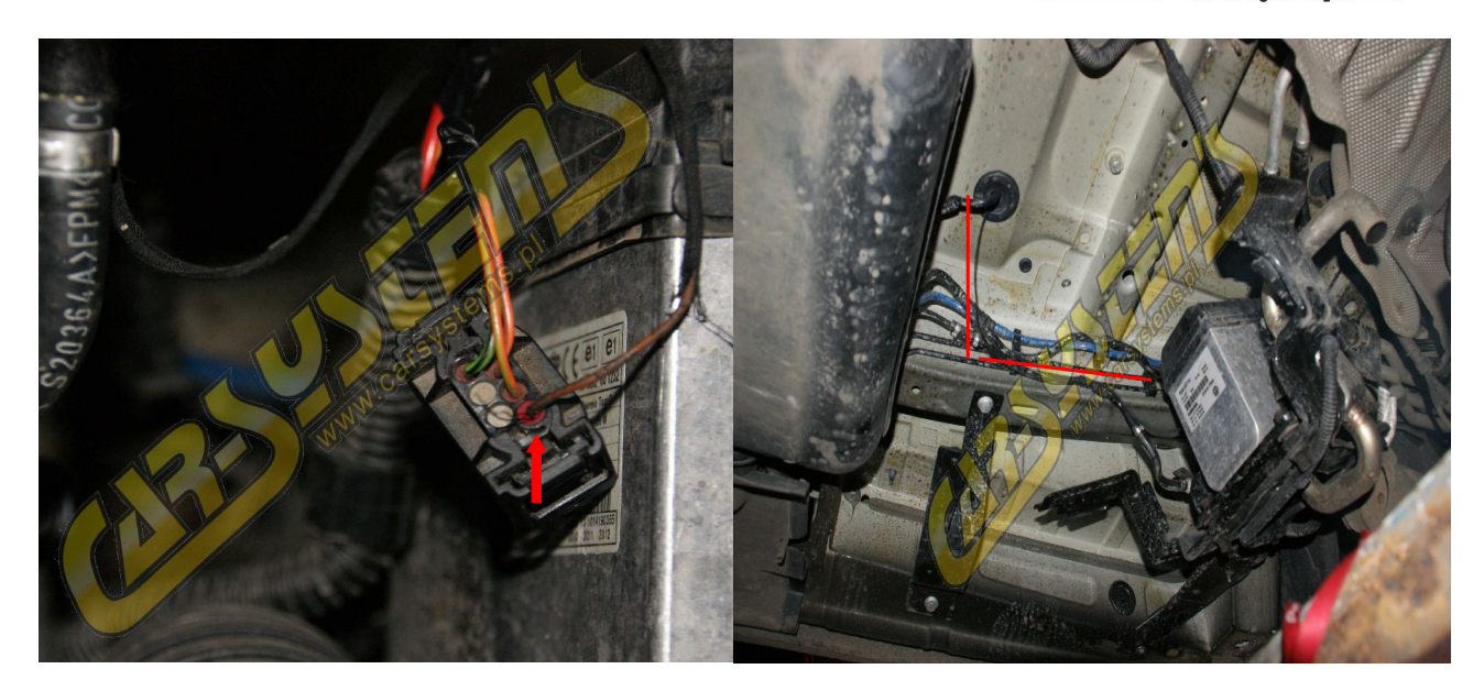
Insert brown connector into 1 pin hole.